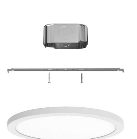
Retrofit (Part# CLIP-SMPR Required)