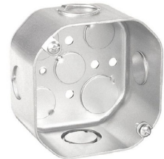
40 Round Junction Box (Metal)