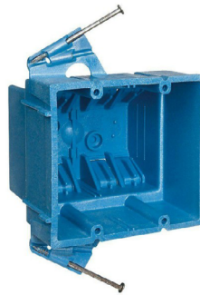
30 Square Junction Box (Plastic)