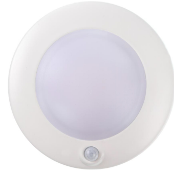
Optional Motion Sensor

Built-in motion sensor with programmable time delay for 1min / 5min / 10min.