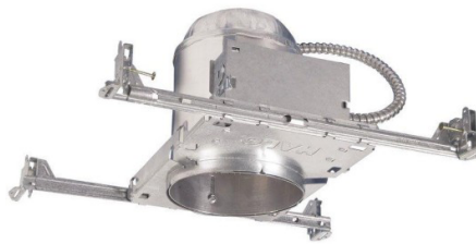
4", 5" or 6" New Construction Housing (Metal)