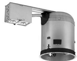
4", 5" or 6" Remodel Housing (Metal)