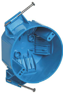
30 Round Junction Box (Plastic)