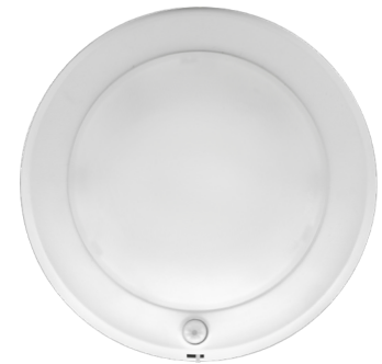
Optional Motion Sensor