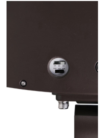
CCT / Output Selector