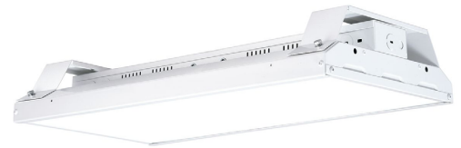
w/Surface Mounting Kit